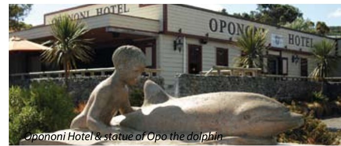
Opononi Hotel & statue of Opo the dolphin

ADULT: $93.00 CHILD: $46.50 (UNDER 5YRS GO FREE)