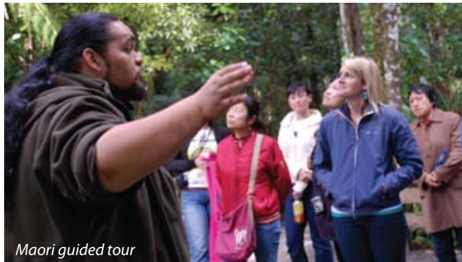
Maori guided tour